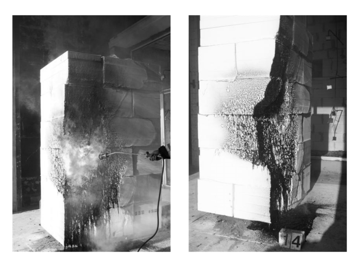
Figure 1. Flame retarded (class E) EPS during and after flame impingement with gas burner.