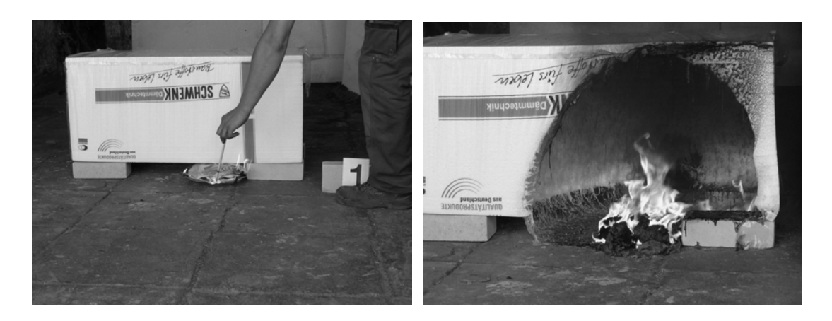
Figure 2. Paper cushion ignited below stored EPS – Melting but no continuous burning of EPS.

like for all other combustible construction products (wood, bituminous roofing felts etc.) the result could be a major fire.